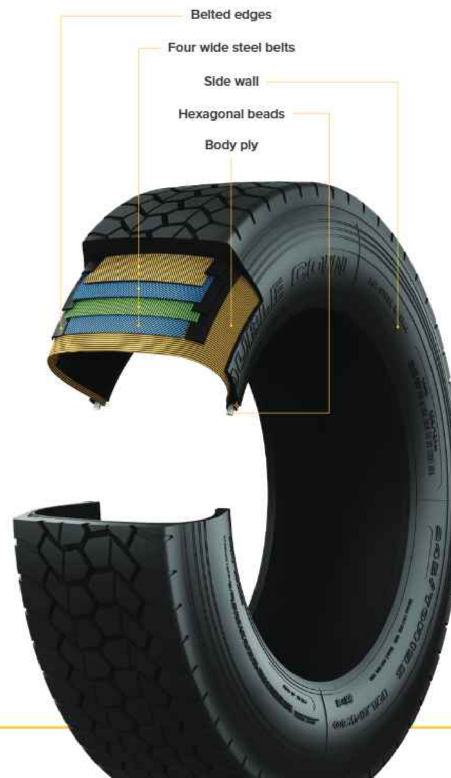
Diagram of tire construction